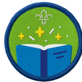
Story Time Activity Badge

In Squirrels there are 13 activity badges including Explore Outdoors, Super Chef, and Go Wild and four challenge awards including All About Me and All About Adventure.