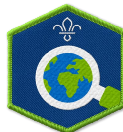
All Around Us Award

Once all of the requirements for a badge have been met, we will award it at the end of the meeting.