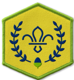
Chief Scout's Acorn Award

Along with these Squirrel specific badges, there are 15 staged activity badges that can be achieved by members in all section of Scouting.